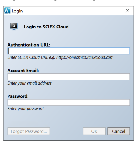
Figure 2 Login Dialog